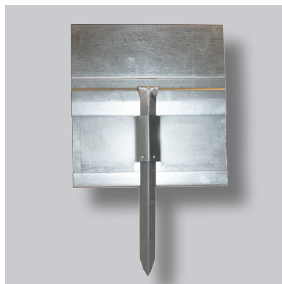
ND GARDLINER® SteelLight 210V