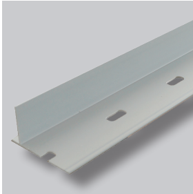
ND GARDLINER® PVC 45D

The GARDLINER® PVC 45D is a rigid plastic edge-retaining profile with a construction height of 45 mm for the sustainable outline of brick paving, block paving, self-binding gravel paths, flower beds, lawn edges and vegetation-free zones on green roofs. The profiles is equipped with perforations and enables perfect straight lines.