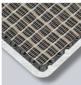
ND Trasdrain 100sv Drainage System